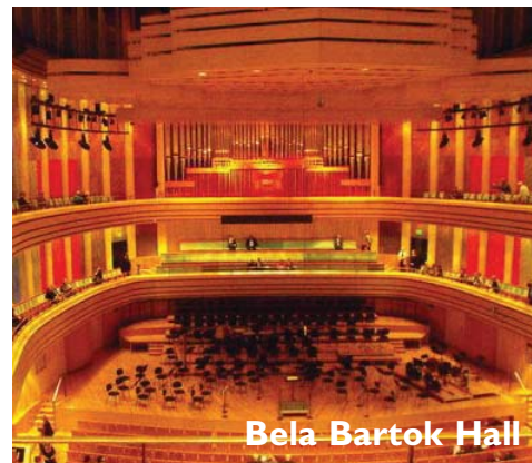
Bela Bartok Hall

Day 1 We meet at Gatwick Airport for our direct scheduled Easyjet flight to Budapest. On arrival we are met by our transfer representative and travel to the 4* Best Western Hungaria Hotel in Budapest for a six night stay on bed and breakfast basis. This evening we attend the opening season of the Spring Festival at the Bela Bartok Hall in the splendid Palace of Arts (details of the concert are specified below).